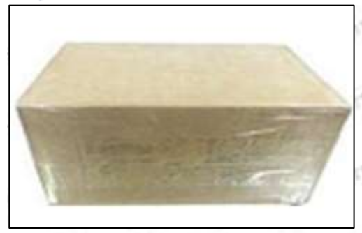
Pic No. 2 Domestic express packaging: Wrapped with Transparent tape