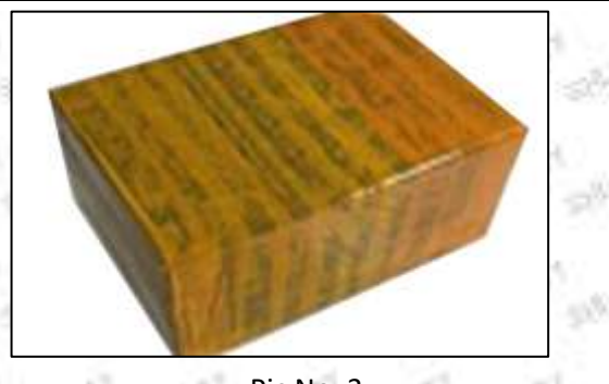
Pic No. 3 International express packaging: Wrapped with yellow tape after wrapping black protective film